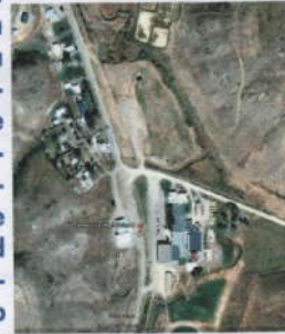
Centerville School Aerial

The festival will be held at the Centerville School at 693 Stockett Rd, Sand Coulee MT. We will have a full double gym with a wooden floor for your toe-tapping pleasure! There will be showers and dressing rooms for our convenience. We plan to have the coolest vendors around for your purchasing pleasure. RVers that come to our event will have dry camping right across the roadway from the event.